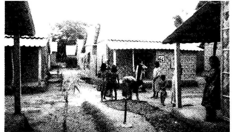
Figure 1 : A Proshika Cluster Village for riverbank erosion affected people

PROSHIKA group members have established 393 RCC pillar production units, 20 bamboo processing plants, 12 MS angle structure fabrication units, 487 sanitary latrine production units, 55 MCR tiles production units and 1,375 rural dwelling houses and 2,288 Resource Centre with MCR tiles roofing through the provision of credit & technical support. In addition, MCR tiles have been used for construction of 30 PROSHIKA Grassroots Training Centres (GTC) and other organizations. PROSHIKA has trained 3,088 group members to produce construction materials.